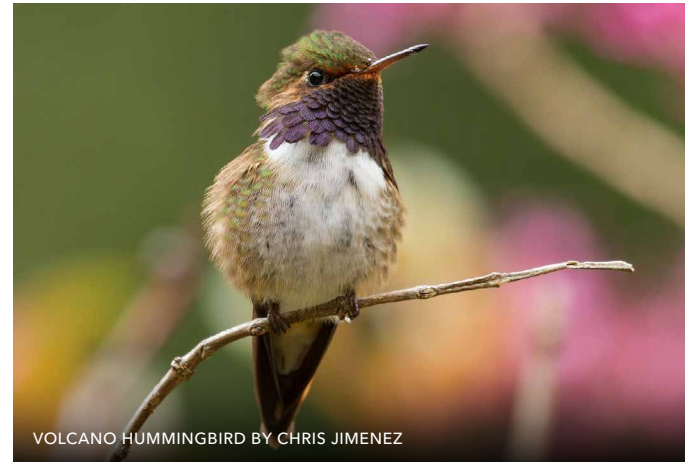
VOLCANO HUMMINGBIRD