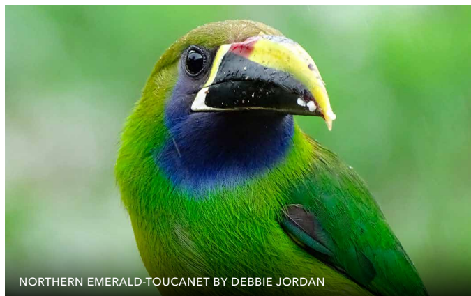
NORTHERN EMERALD-TOUCANET BY DEBBIE JORDAN

Travel to Cerro Lodge today, arriving in time for lunch at the lodge. Later this afternoon, when it cools off a bit, go for a boat ride along the Tárcoles River to watch for both water and shore birds, like Double-striped Thick-knee, Roseate Spoonbill, jacanas, and ducks. The Tárcoles River basin is one of the most important in the Pacific coastal region; it drains virtually the entire western side of the Central Valley. Tárcoles hosts an