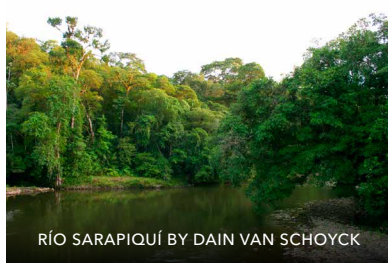
RÍO SARAPIQUÍ BY DAIN VAN SCHOYCK