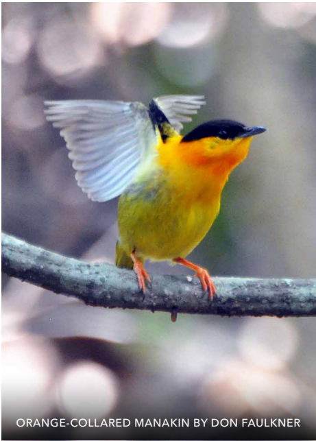
ORANGE-COLLARED MANAKIN